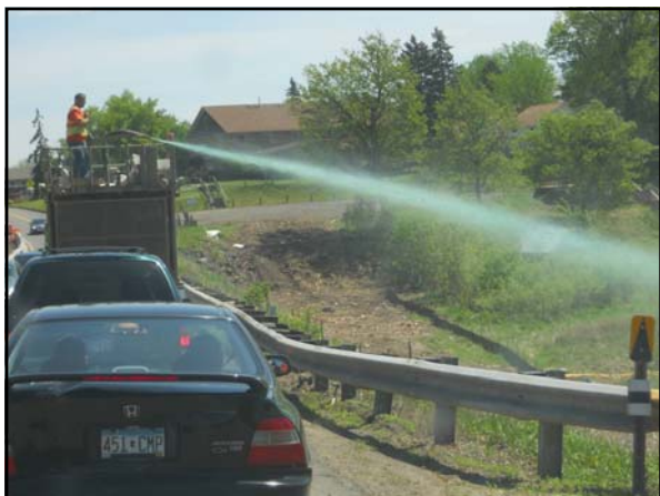
Temporary stabilization during construction to protect water resources