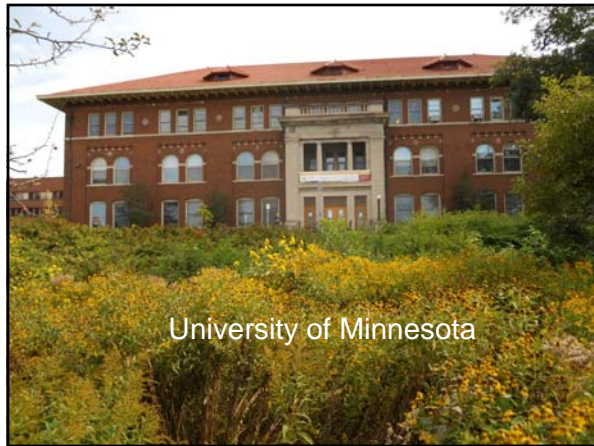
University of Minnesota