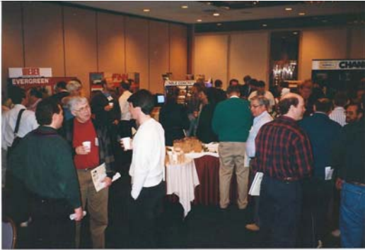
Where the real learning takes place